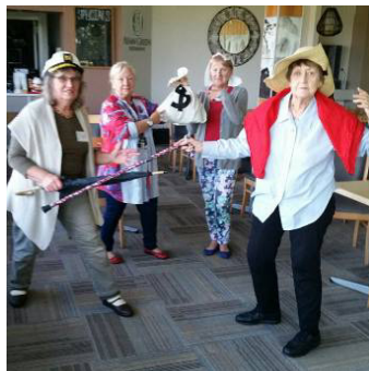
The drama class dramatising