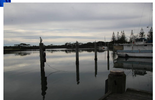
The social group socialising on the Brunswick River

Trivia Answer: Belize (formerly “British Honduras”).