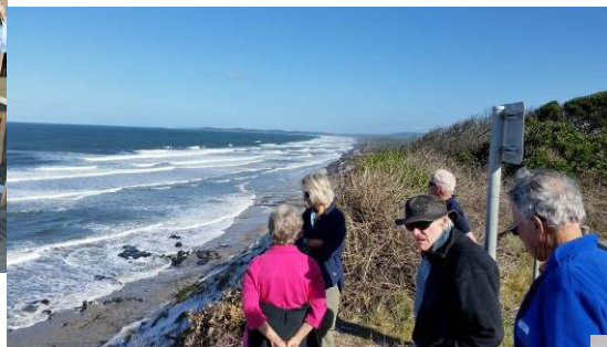
The bush walkers, a-walking - or whale watching - or catching breath

My apologies to Heather Munro, whom I misnamed in the recent Advocate column!